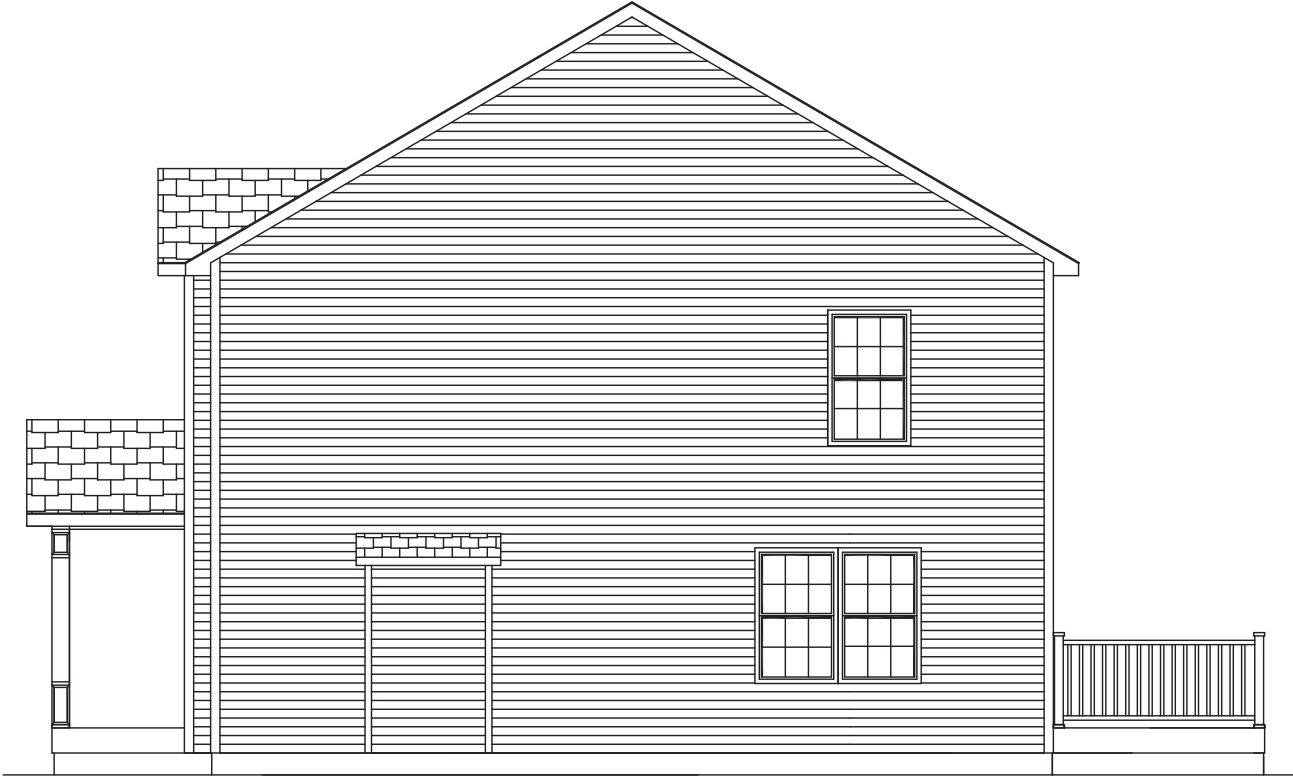
RIGHT GABLE ELEVATION